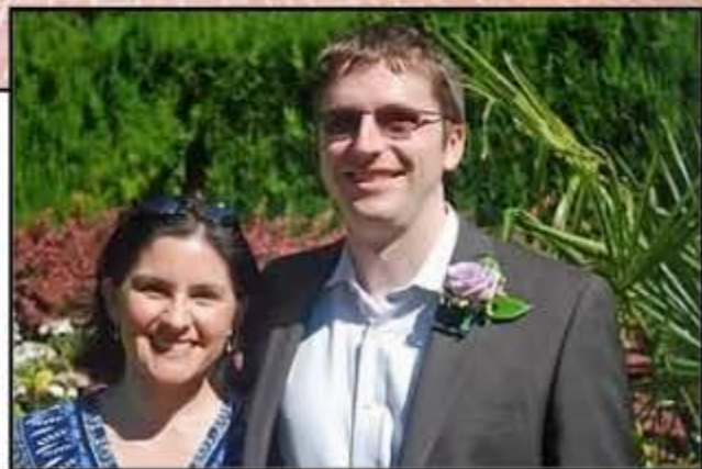
Our Rose Garden Ceremony