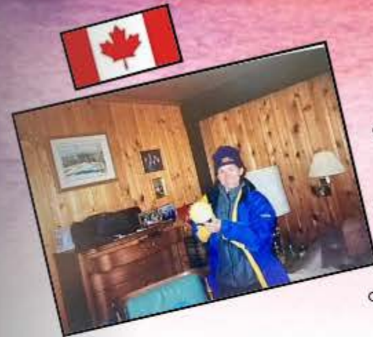
Top left: Showing off my hand print in Canada at my maternal grandparents' vacation home. Top right: Standing in front of the village house in Greece where my father was born. Below: Me with my parents, two brothers and sister when I received a graduate degree.

Growing up, I spent every vacation in either Greece or Canada visiting family. I started traveling as a toddler, and these experiences have had a huge impact on my sense of self. I am lucky in that I got to know all of my grandparents in their home countries, and the feeling I have of being a child of immigrants is really strong.