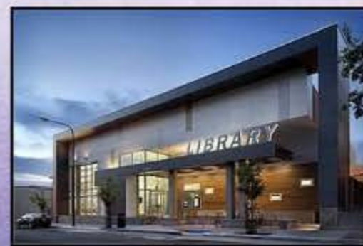
Above: The play area in a park close by, and below a branch library blocks from our home.