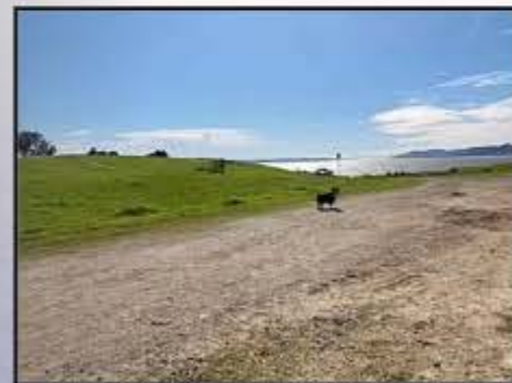
Left: View of the Golden Gate Bridge from a local dog park. Maple is taking in the view!

Within walking distance, we have a modern library branch (we are heavy users!), a public swimming pool (ditto!) and several parks, as well as stores, restaurants, the post office, and K's school. Zac's sisters and their families live a block over, and our block is one full of families with children ranging from toddler to high school. Our block has an annual block party (sometimes we have two if feeling ambitious) and there is a strong sense of solidarity in our neighborhood. People really look out for one another. It is a wonderful place to raise children.