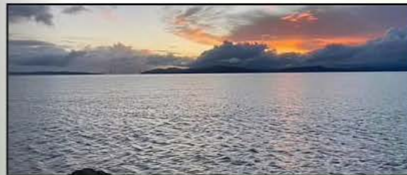
Photo above: I love to sail, and here is a photo of the San Francisco Bay--a great place to sail, and easy to get to from where we live.

*I met the Dalai Lama when I was performing at the World Festival of Sacred Music at The Hollywood Bowl.