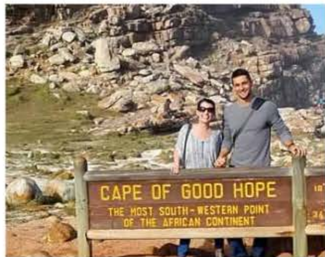
South Africa, 2014