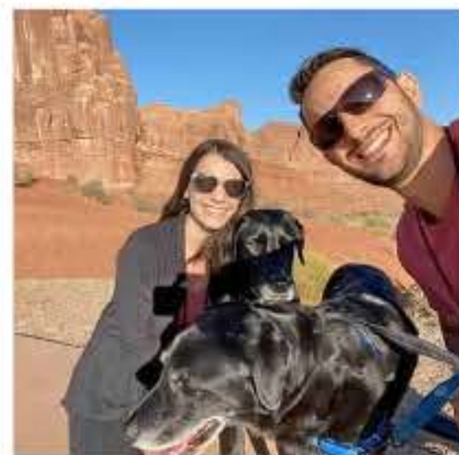
Arches National Park, 2020