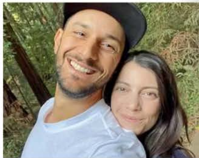
Muir Woods National Park, 2023